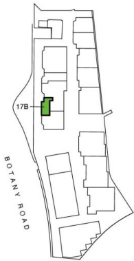
LOCATION PLAN NOT TO SCALE