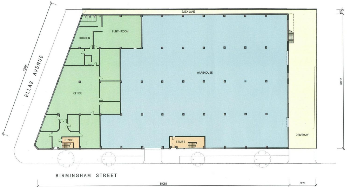
1 EXISTING - GROUND FLOOR PLAN SCALE 1:250 @ A3